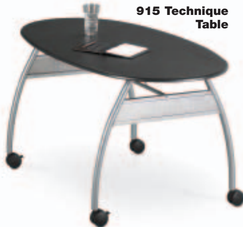
915 Technique Table