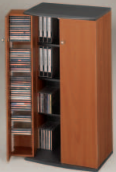
965 Media Cabinet

Eastwinds™ features mobile, efficient laptop caddies that allow you to position your most valuable piece of equipment where it's most convenient . We also put media and reference materials in their place with smart, complimentary storage options. Welcome to the New Office. Welcome to Eastwinds .