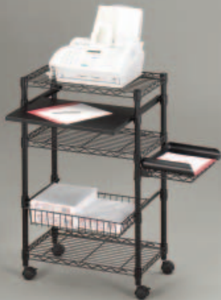
955 High Wire Cart