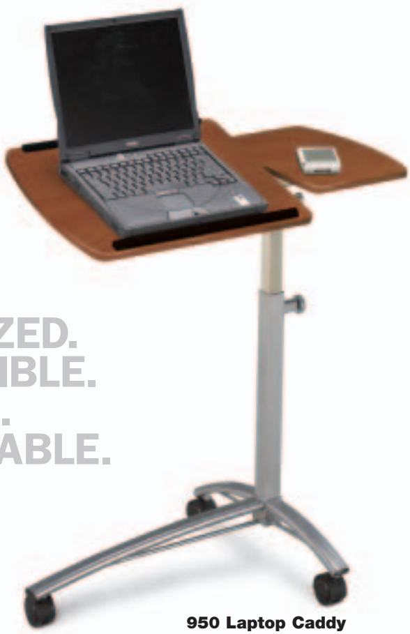
950 Laptop Caddy

Eastwinds™ features mobile, efficient laptop caddies that allow you to position your most valuable piece of equipment where it's most convenient . We also put media and reference materials in their place with smart, complimentary storage options. Welcome to the New Office. Welcome to Eastwinds .