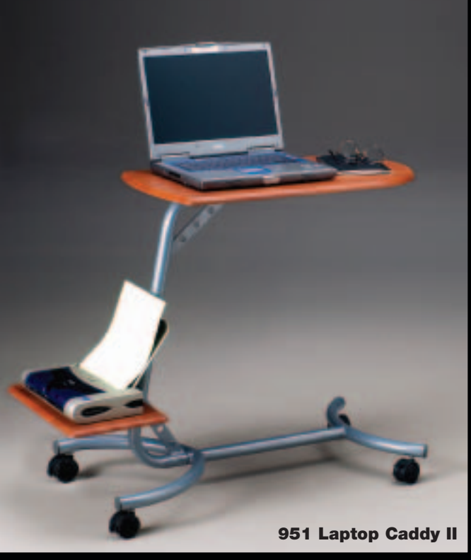
951 Laptop Caddy II