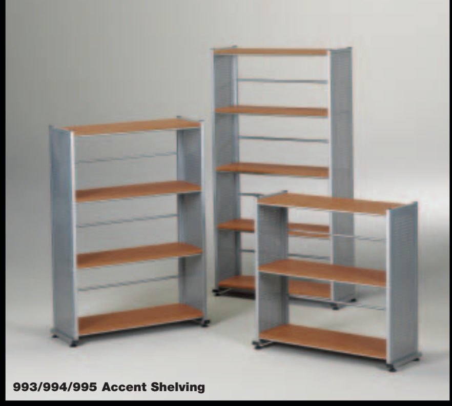
993/994/995 Accent Shelving