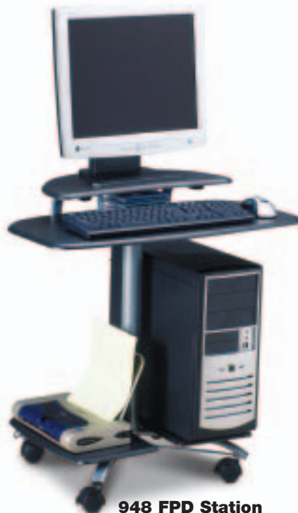
948 FPD Station

Eastwinds™ combines the quality and features of contract office furniture with pricing attractive to even the most modest of budgets.